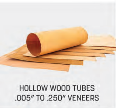
HOLLOW WOOD TUBES .005" TO .250" VENEERS