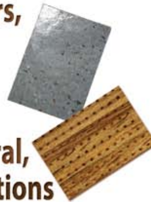
PerforaBoard Acoustic Tile, Boards & Panels

or 90% post-recyclable AcoustaCore for architectural, thermal & acoustic applications