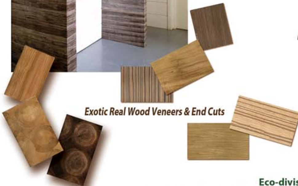
Exotic Real Wood Veneers & End Cuts