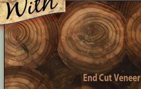
End Cut Veneer

AcoustaCore Board & Panels PerforaBoard Cork (soft touch) Bark & Banana Fiber Exotics (end cuts) HollowWood Tubes Veneer wrapped poles & posts Bamboo (translucent) Leather (permanent print) Translucent veneers Real Wood (any species)