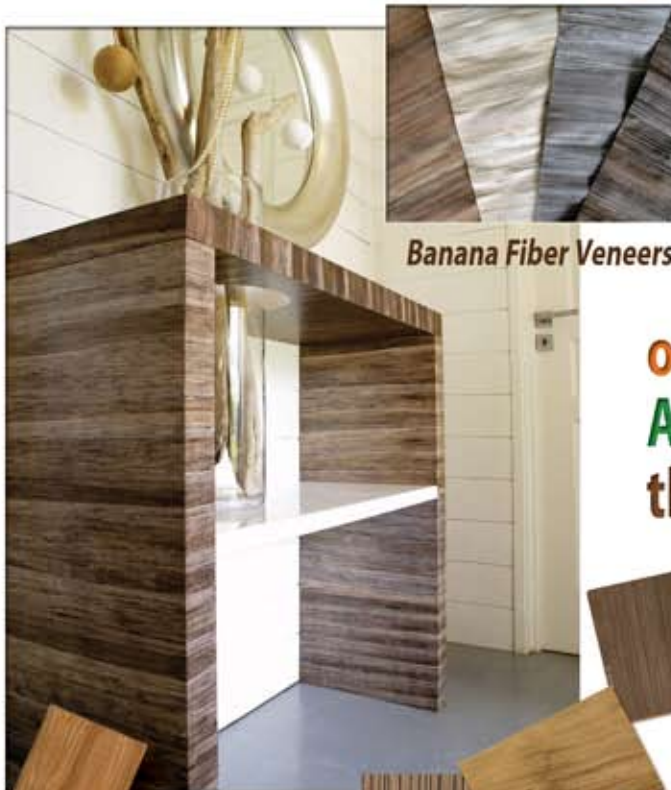
Banana Fiber Veneers

or Banana Fiber, Leather or Real Wood Micro-Thin Veneers,