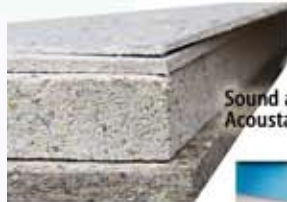
Sound and Temperature Control AcoustaCore Panels