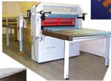
Continuous Feed Foam Sheet and Panel Laminator