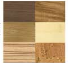
Translucent/ Extreme Flex Wood Veneers