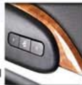
3-D Moldable Wood